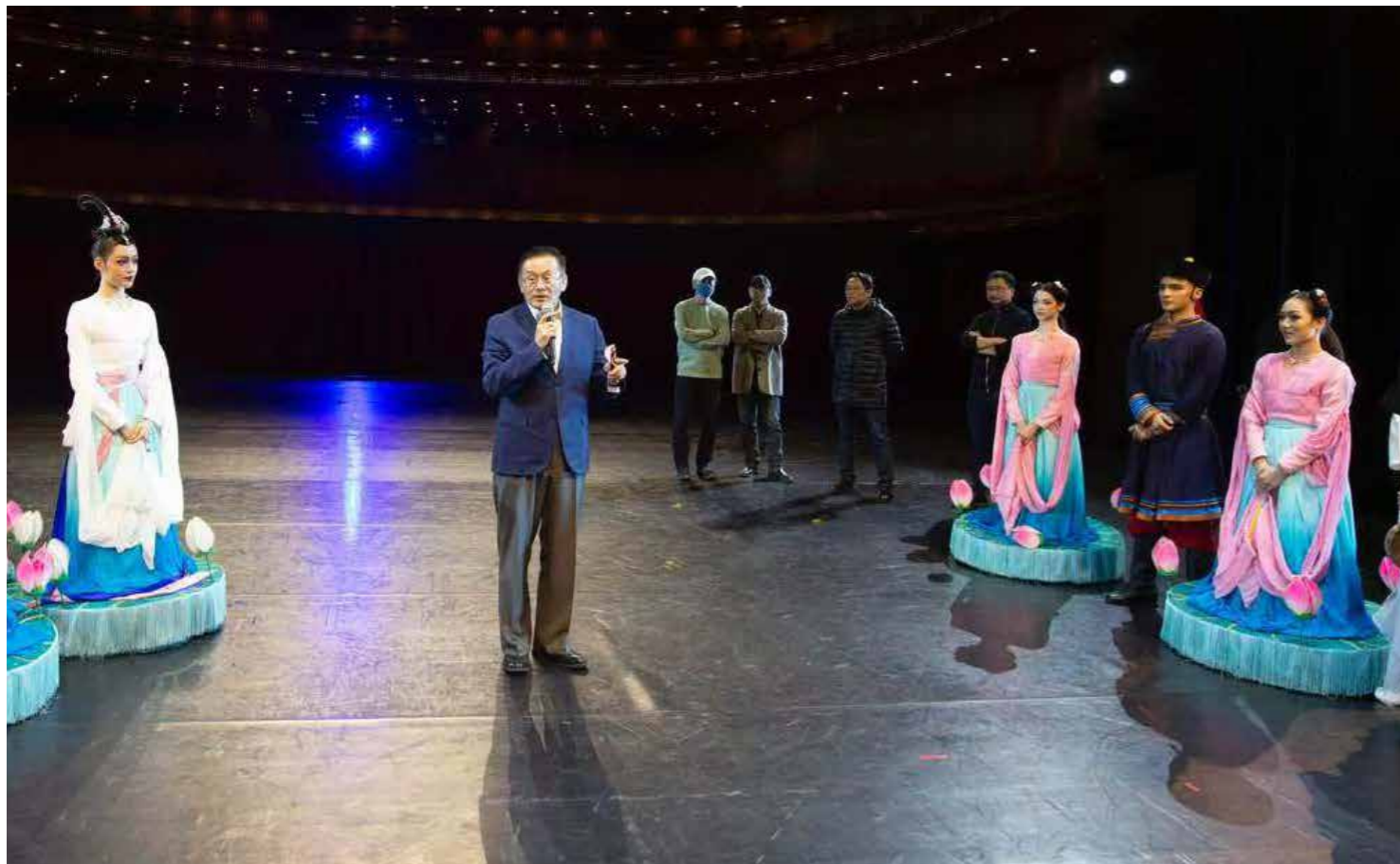
1 > A group photo of the cast and crew of the "Dance for People" performance. 2 > The secretary Ba Tu was speaking at the "Dance for People" performance.

The idea of the dance-poetry Stories came from the heroic deeds of Chen Wangdao and nine other people who were generations apart in the newly-founded nation but shared the same belief in the founding values of the CPC – to seek happiness for our people and to pursue the rejuvenation of the nation. It is the aim of this dance choreography to promote the public awareness of the Party's founding values using a variety of dance types including traditional Chinese dance, Chinese ethnic and folk dance, ballet, contemporary and modern dance, ballroom dance, and musicals. It is a testament to the world-class dance education that BDA offers, and it has since received much media attention.