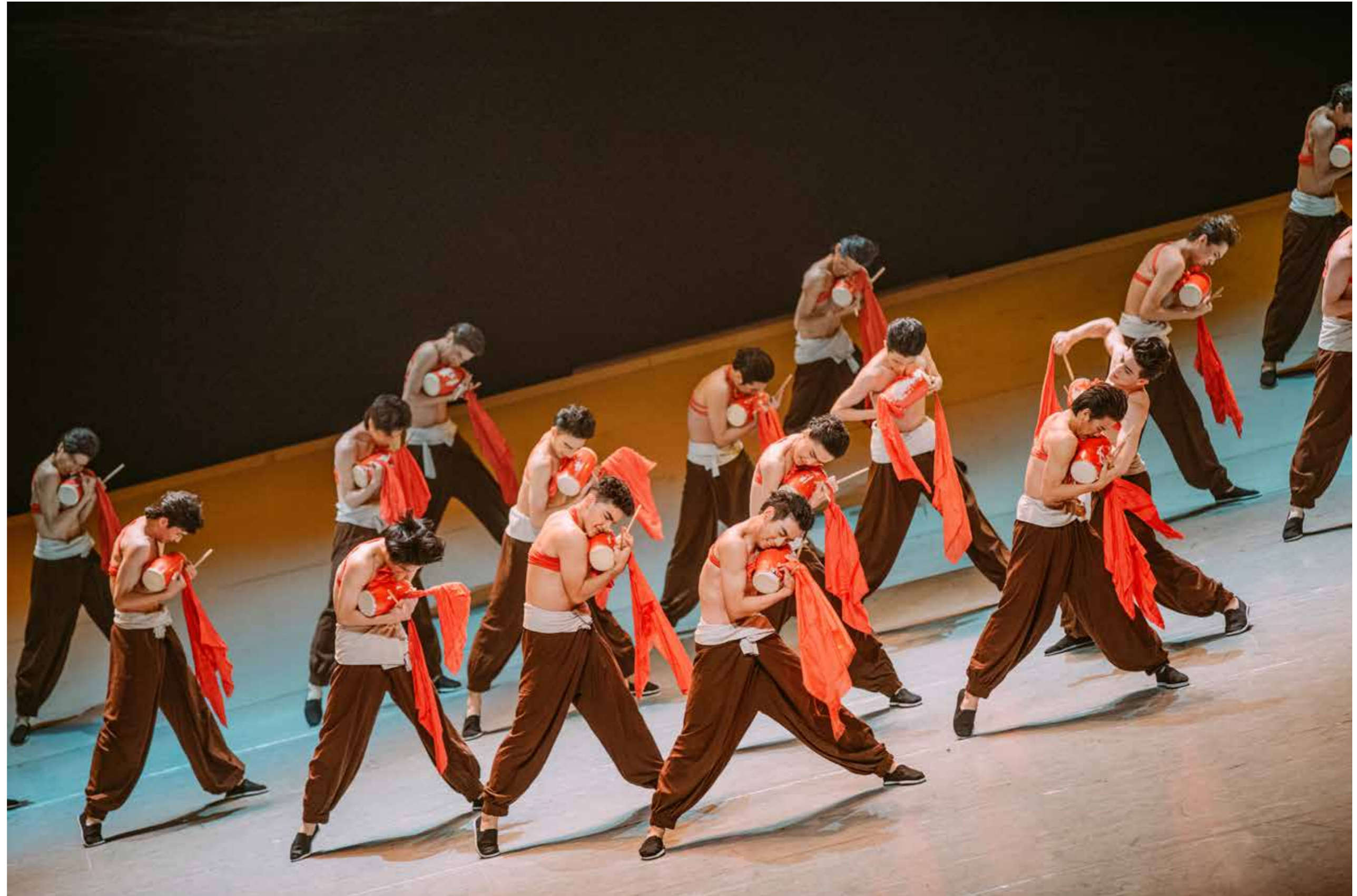
> 2021 “Dance for the People” special performance - Chapter Two - Chinese folk dance The Yellow Loess Plateau , choreographed by Zhang Jigang in 1980s

The main theme of the “Hundred dances for the CPC’s Centenary” showcase is Dance for the People , which is also a national guideline for the development of dance as a form of art. “Literature and art must show compassion. This decides the fate of their creativity,” said Xi Jinping, adding that to achieve success, it is crucial for artists to be able stand in our people’s shoes and have a willingness to serve. He said that this is the only right path to follow, and an artist can obtain great fulfilment from this profession. Mr Jia Zuoguang, a great dancer, is an outstanding example of this. His most celebrated works – Sabre Dance ; Oroqen – were based on his close observation of the daily life of shepherds and warriors, in which activities like riding horses, wrestling, archery, and milking